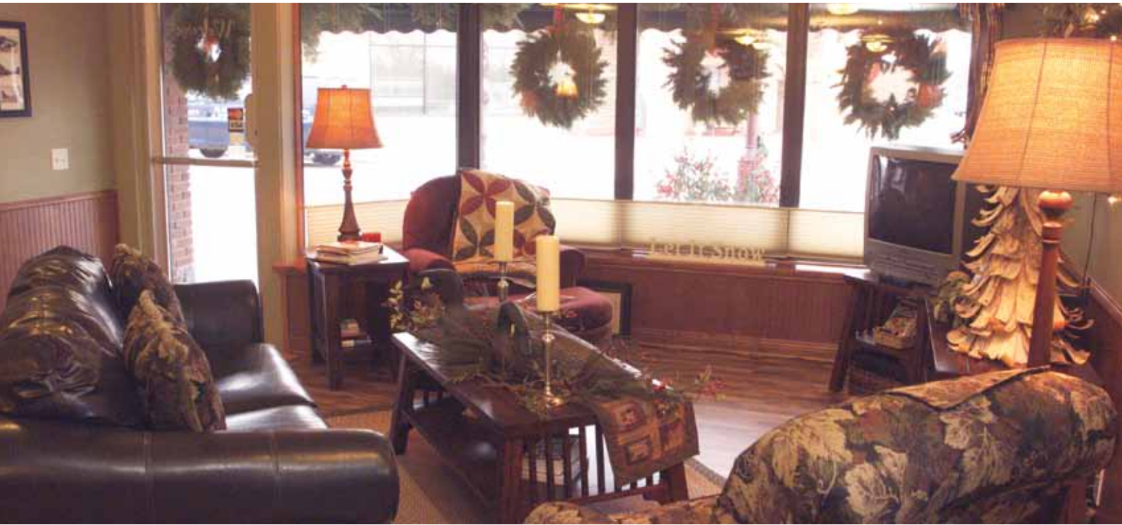
The living room provides a welcoming atmosphere at Tatanka Bluffs Bed and Breakfast in Redwood Falls, MN.