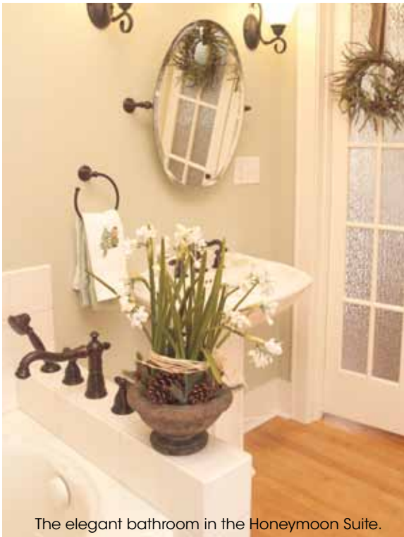
The elegant bathroom in the Honeymoon Suite.