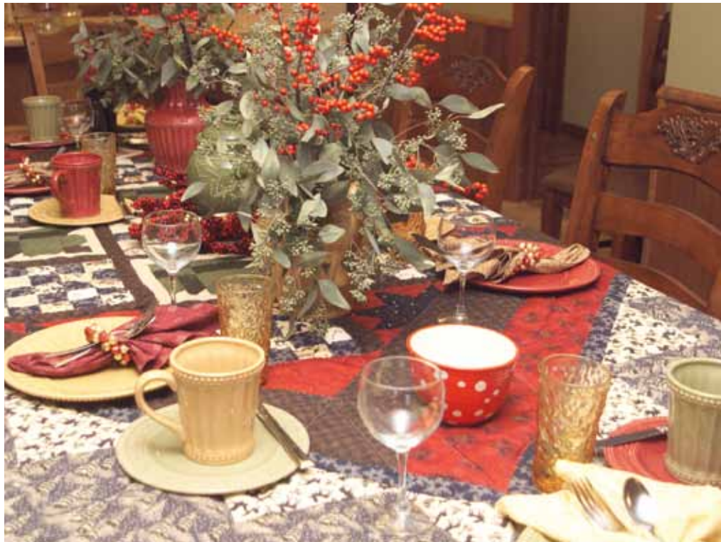
The inviting and festive dining room sets the mood during mealtime.

When my husband returned late afternoon, we went to dinner. For our first night, we chose to dine at the Valley Supper Club in North Redwood, a mere five-minute drive away. Though the atmosphere was, well, supper-clubbish – banquet tables and metal chairs, white walls, dim light – the food was delicious.